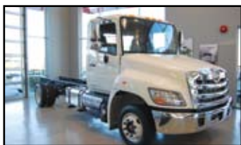
2011 Hino 198

J-series 7.6L 6 cylinder turbo diesel engine, 220 HP and 520 lb. of torque. Allison 6 speed 1000 RDS automatic providing PTO capability, 19,500 lbs GVW, front and rear axle capacity 7,280 lbs each. Lease from $1,149*/mo Plus applicable taxes *60 mo lease $0 down O.A.C.