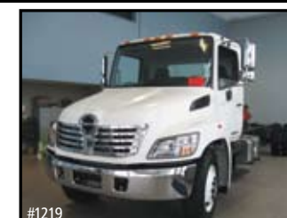
#1219 2010 HINO 358VA Air Ride

260HP, 35,000 lb GVWR, full load, automatic Lease from $1,219*/mo 1 remaining! *60 mo lease $10,000 down O.A.C., $12,840 residual