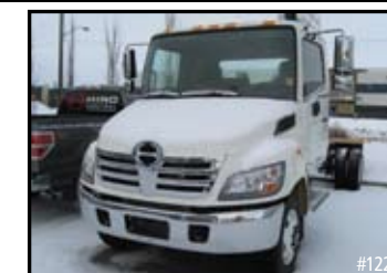
#1220 2010 HINO 185, Limited Edition

260HP, 35,000 lb GVWR, full load, automatic Lease from $1,219*/mo 1 remaining! *60 mo lease $10,000 down O.A.C., $12,840 residual