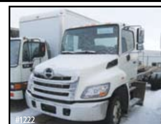
#1222 2011 HINO 258

19,000 lb GVWR, 220 HP, automatic, full load cab, GPS. Lease from $975*/mo 3 to choose from! *60 mo lease $10,000 down O.A.C., $10,280 residual