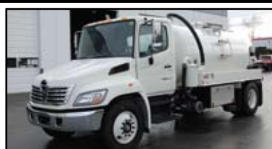
2008 Hino 358 c/w 1800 gal Vacuum Tank

220 HP diesel engine, Allison automatic, AC, air brakes and a Jerr-Dan 10,000 lb capacity tow deck and wheel lift. Chrome package, Alcoa wheels, storage box. Fully inspected. $52,995 Plus applicable taxes