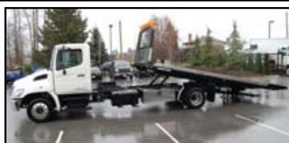
2007 Hino Model 258LP c/w Jerr-Dan Tow Deck

J-series 7.6L 6 cylinder turbo diesel engine, 220 HP and 520 lb. of torque. Allison 6 speed 1000 RDS automatic providing PTO capability, 19,500 lbs GVW, front and rear axle capacity 7,280 lbs each. Lease from $1,149*/mo Plus applicable taxes *60 mo lease $0 down O.A.C.