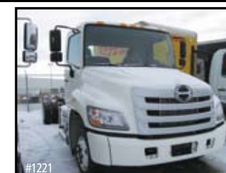
#1221 2011 HINO 198

175 HP, automatic, full load cab, 18,000 lb GVWR. Lease from $855*/mo 6 to choose from! *60 mo lease $10,000 down O.A.C., $9,000 residual